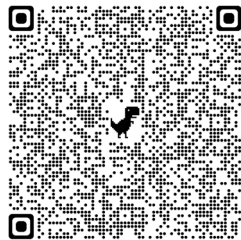
Sts. Joseph & Paul QR Code for Online giving