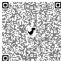
Sts. Joseph & Paul QR Code for Online giving