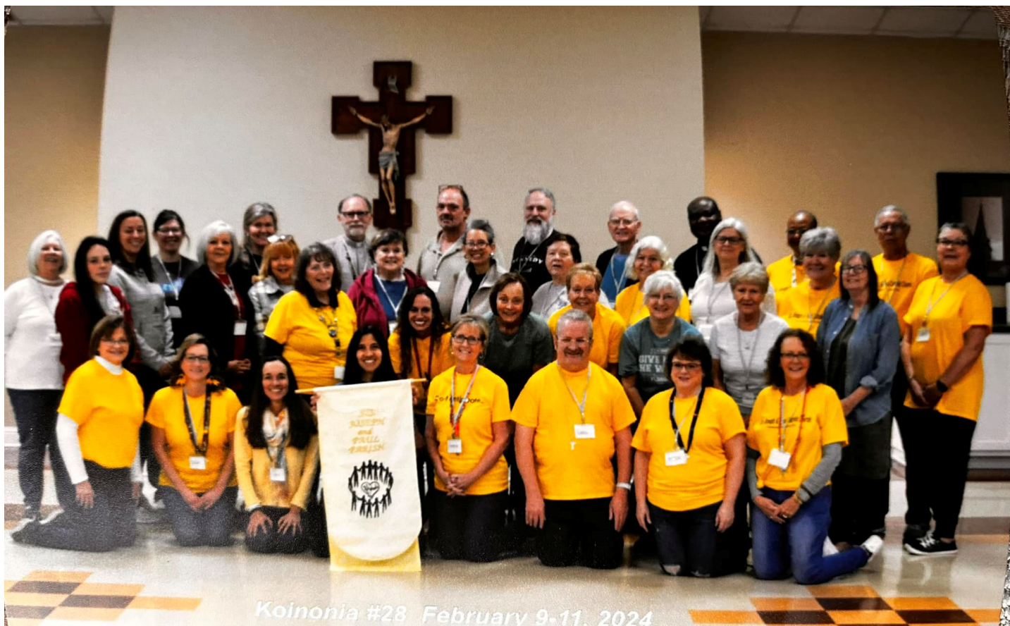
Koinonia #28 February 9-11, 2024